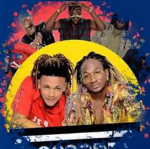
GUINEA KONAKRY DANCE GROUP