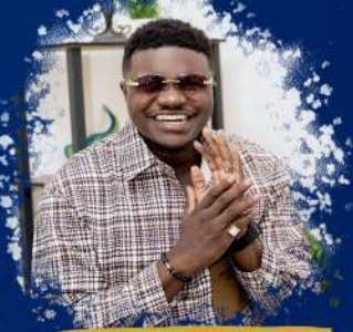
SUH GODISMA FUNGWA : ACTOR/ PRODUCER/COMEDIAN